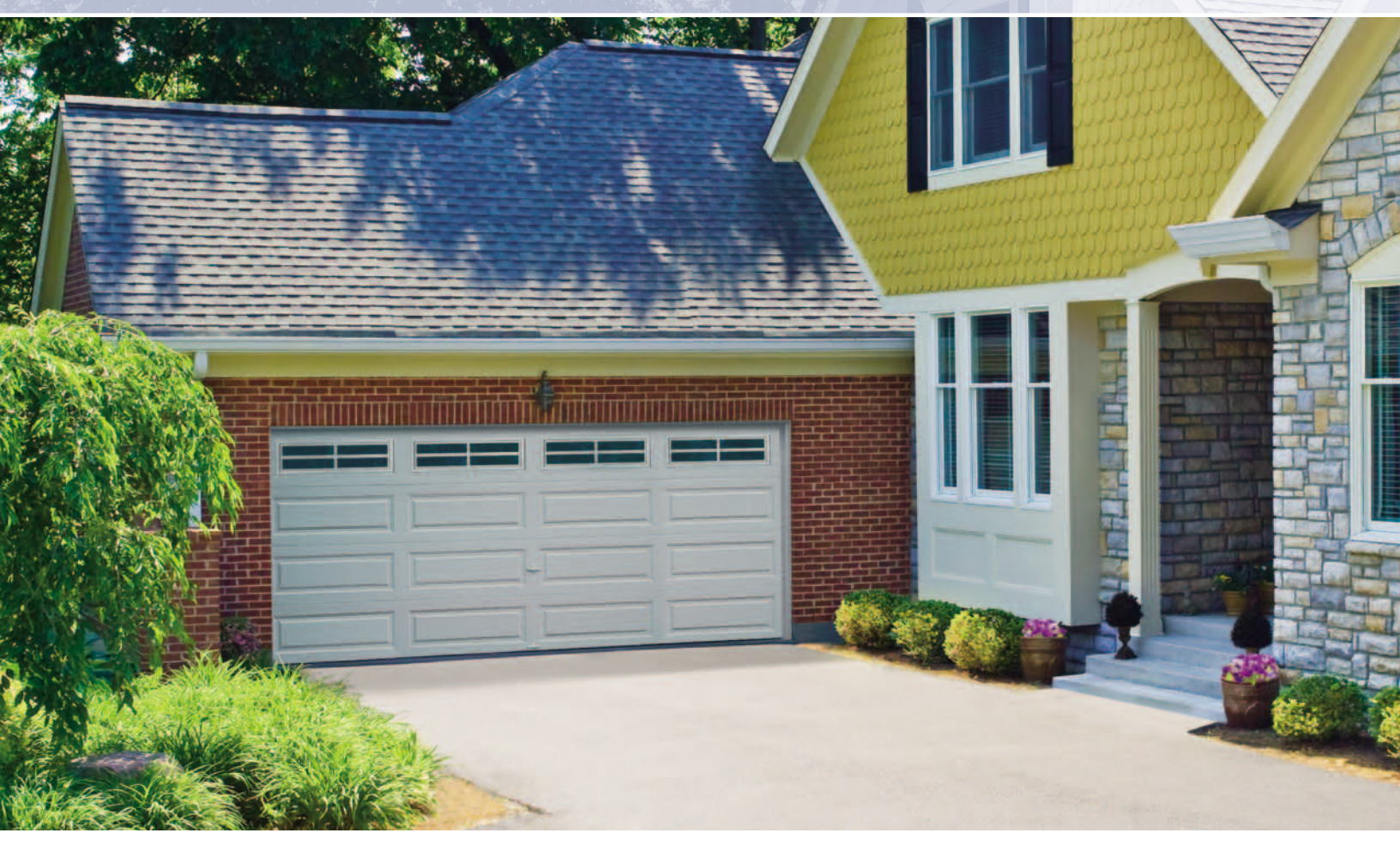
Model 9133, Long Elegant Panel with Optional Colonial 609 Window Design

Improve your home's appearance and energy efficiency with a Clopay Premium Series insulated garage door. With 1-3/8" of polyurethane insulation, Models 9130, 9131, 9132 and 9133 offer an exceptional insulating R-value, strength and security, as well as quiet operation and a beautiful appearance. Choose from three panel styles, seven color options and a wide range of decorative window options to create a door that fits your budget and enhances your home's curb appeal.