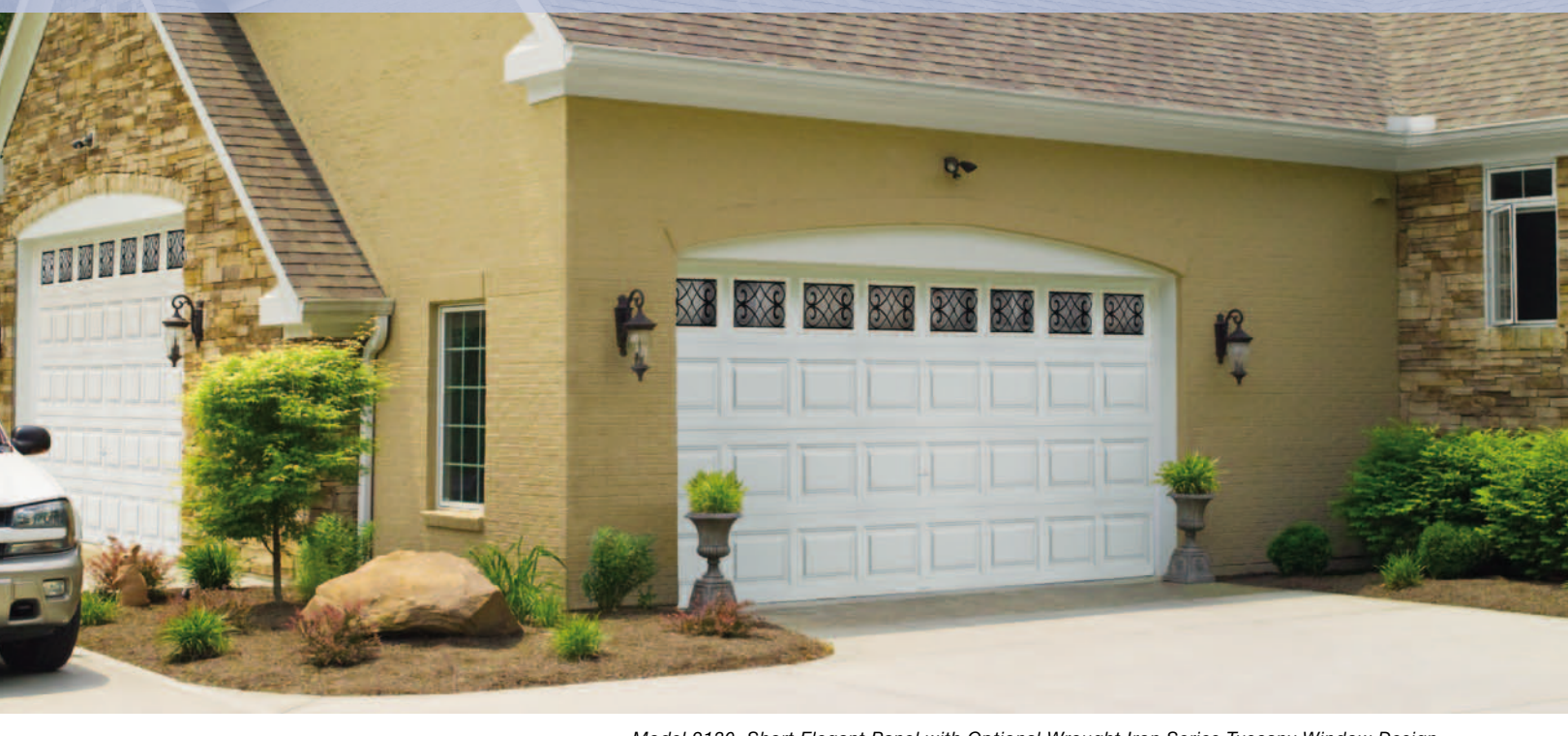
Model 9130, Short Elegant Panel with Optional Wrought Iron Series Tuscany Window Design